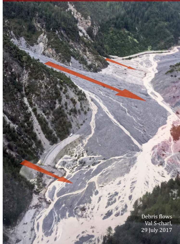
Debris flows Val S-charl, 29 July 2017

Fortunately, no one was injured or killed on the busy road. However, road users were blocked by the debris flows. Some of them were only evacuated on the next day.